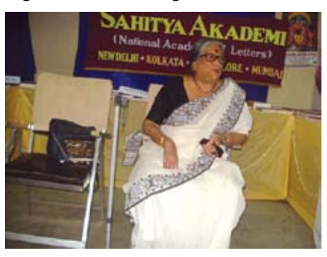
Professor Nabaneeta Dev Sen delivering the inaugural speech

The regional office of Sahitya Akademi at Kolkata organized a week long book exhibition to mark the National