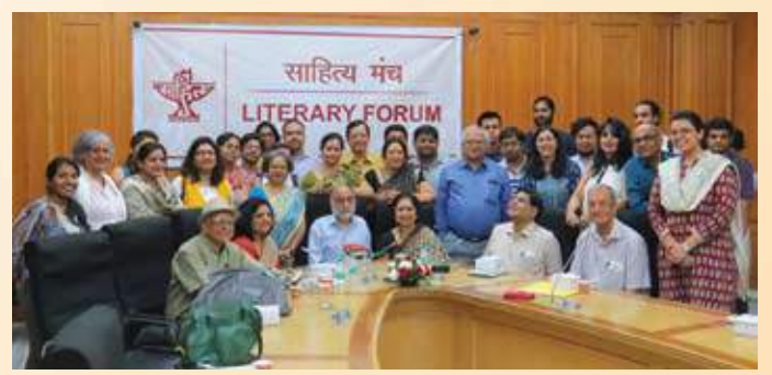
Participants of the Literary Forum on Literature for Social Change