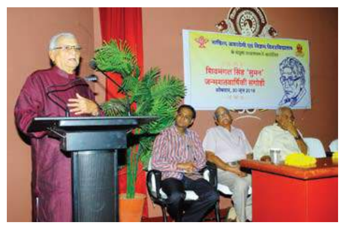
Inaugural session of the Shivamangal Singh Suman Centenary Seminar in progress