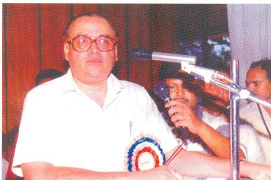
Speaking at a Urdu Conference

His book, National Movements and Indian Constitution also has been a notable contribution. He has liberally extended his support to his Home State by being a Member of Number of State Level Committees Govt of Bihar, Bihar Urdu Academy