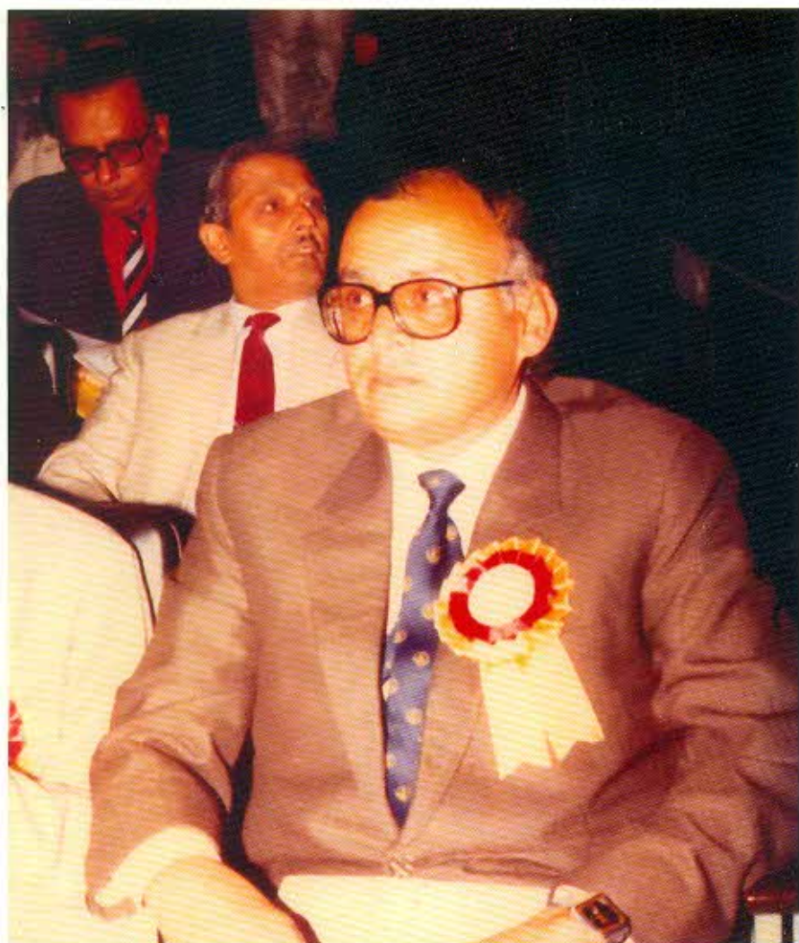
At the Sahitya Akademi Award Presentation Function

events around him- communal riots, corruption, destitution, poverty and the distressing debasement of human values. Undoubtedly, this period was extended to a much earlier decade, which witnessed the Indo-Pakistan War of 1971-72, the creation of Bangladesh and the resultant uprooting of the migrants of that country, euphemistically called Biharies. This accentuation of human suffering touched the author. His novel Do Gaz Zameen narrates the story of this suffering, which incidentally marks the maturing of an 'experimenting' abstract artist into a responsible and committed writer."