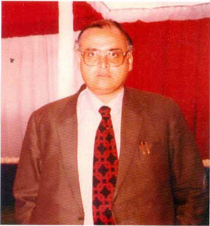
In a contemplative mood...

and has also represented India at an International Meet at Almaty, Kazhakistan , in August 1995.