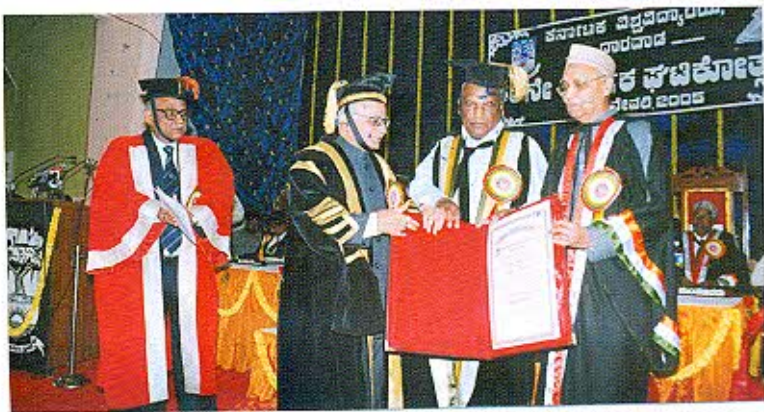
Honorary Doctorate was awarded to Kanavi by the Karnatak University in 2004