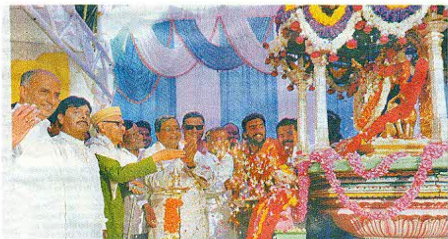
Writer Chennaveera Kanavi inaugurating Mysuru Dasara atop Chamundi hill in Mysuru on 01-10-2016 as Chief Minister Siddaramaiah and others look on.

articulate a philosophy of life that accepts life but also questions it critically. His poems have become part of our life, and his poetry has won him many important awards, both national and regional.