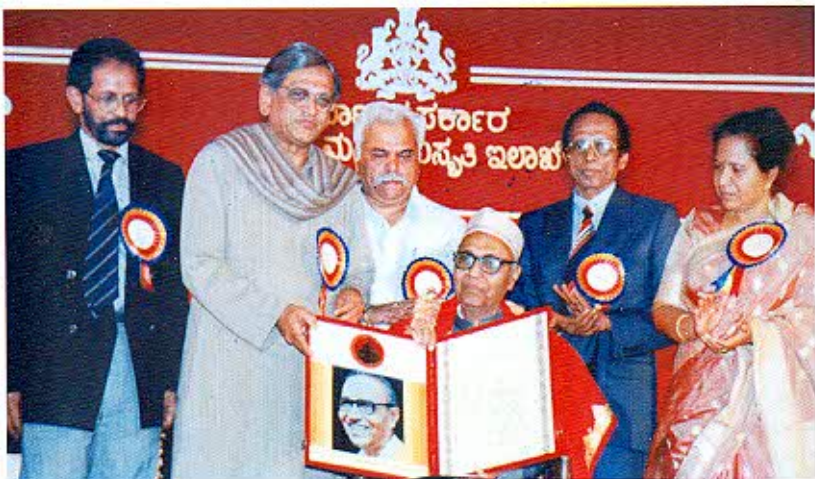
"Pampa Prashasti", a prestigious literary award being presented by S.M. Krishna, the then Chief Minister of Karnataka (1999)