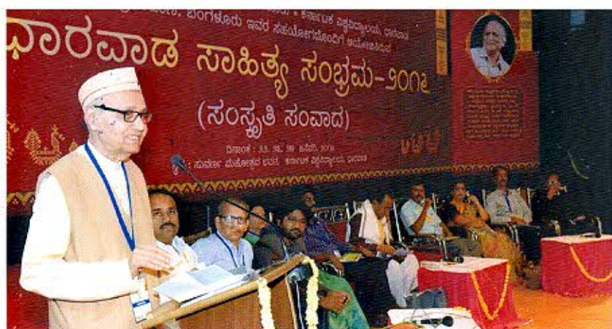
Reciting Poetry during the "Dharwad Sahitya Sambhrama" on the line of Jaipur Literary Festival (2016)

Cultural Ambassador : Status as a symbol of Kannada culture he has been participating for the last four decades, in important cultural and literary events both in Karnataka and at National level.