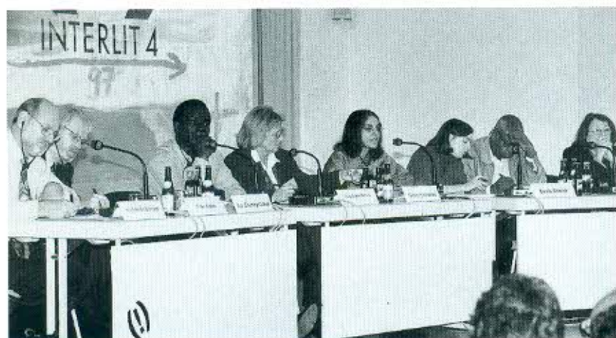
At Internationale Literaturtage, Erlangen, Germany, in October 1997

A Southern Harvest (ed.), Katha-Rupa, New Delhi, 1993.