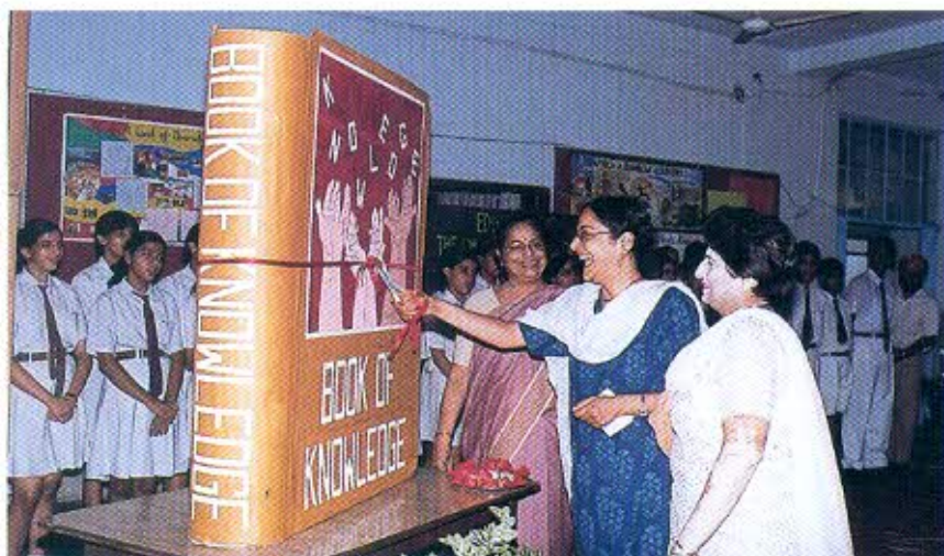
Inaugurating a Book Festival at Springdales School, Delhi

writing, Githa Hariharan has interesting observations to make: "Within India the official line on representation seems to often get reduced to writing in English versus other Indian languages. The English vs. the other Indian languages discussion — and I'm not going to say controversy or quarrel — has not been taken to a second phase. I don't think it is very interesting or useful to go on and on about how Indian writers in English get more attention and so on. Obviously, there is a relationship between English and power; Indian academics in English get more attention, so do papers and TV news channels in English — it is like saying the upper class gets more attention. So it is something you should acknowledge quickly and move on to more interesting issues: such as what are some of the ways we can actually not throw out English but counterbalance it with more attention to other languages, more ways of sharing power."