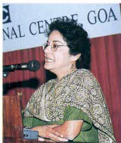
Speaking at a function in Goa