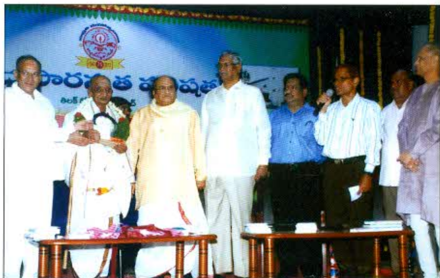
With C. Narayana Reddy, Jnanpith Awardee and office bearers of Andhra Saraswatha Parishat, Hyderabad