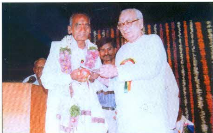
Honoured by Andhra Pradesh Governor, Krishna Kanth