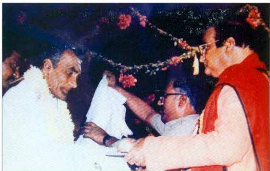
Receiving award from N.T. Ramarao, Chief Minister of Andhra Pradesh