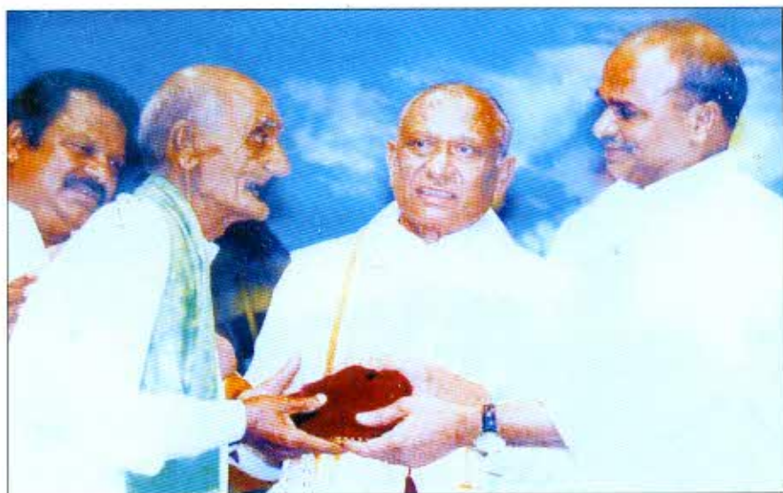
Has been honored by Chief Minister of Andhra Pradesh, Y.S. Rajasekhara Reddy

He has written Forewords, Reviews, given valuable opinions for about 300 books.