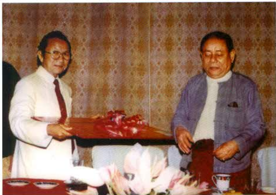
At a poetry festival in Myanmar

issues, particularly in human and personal relationships, such as issues of moral bankruptcy as reflected in Ichegi Sam ; corruption as in 'Wakat' (Complaint); social taboo and superstition as in 'Pukhri Macha'