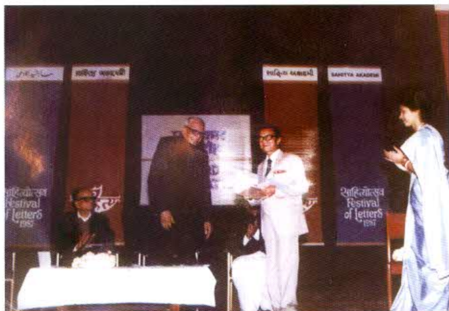
Receiving Sahitya Akademi Award