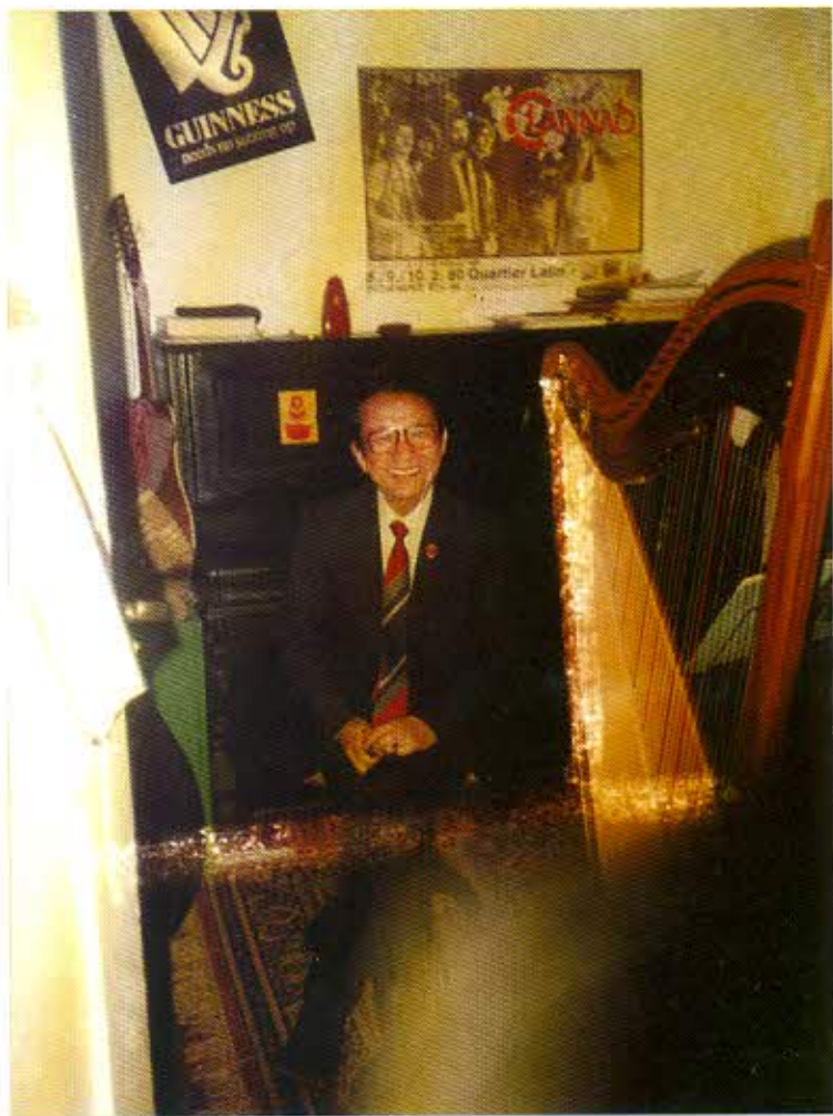
On a foreign tour