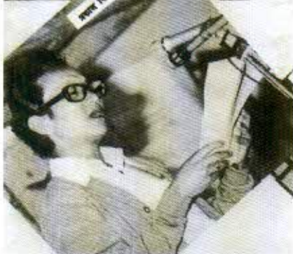
Attending a poetry session at Bhopal with other poets