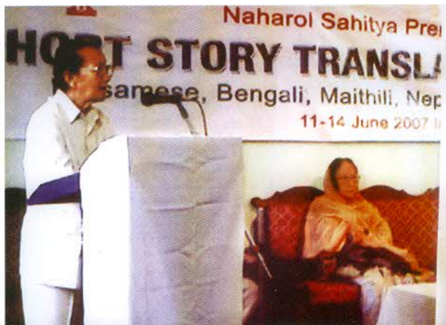
Attending a literary function

(Small pond); hypocrisy as in 'Wakat Sareng' (The bribing fish) etc. He is primarily anxious about the emerging symptoms of depersonalized relations as depicted in the illicit affairs of Sana and the mother-in-law in his