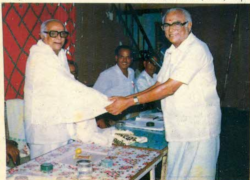
Receiving the Lilly Devasigamani Literary Award

En Ilakkiya Nanbargal , Madras, South Asian Books, 1993, 167p.