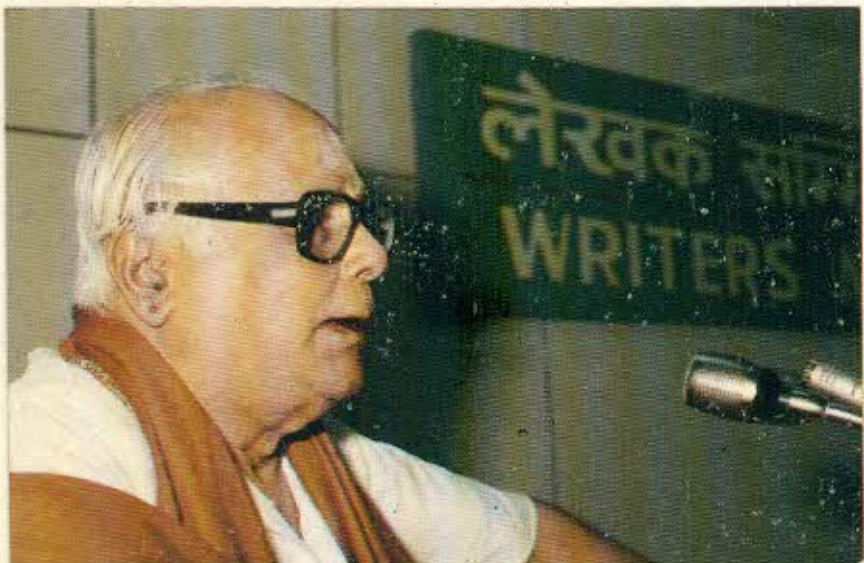
In a Writers' Meet