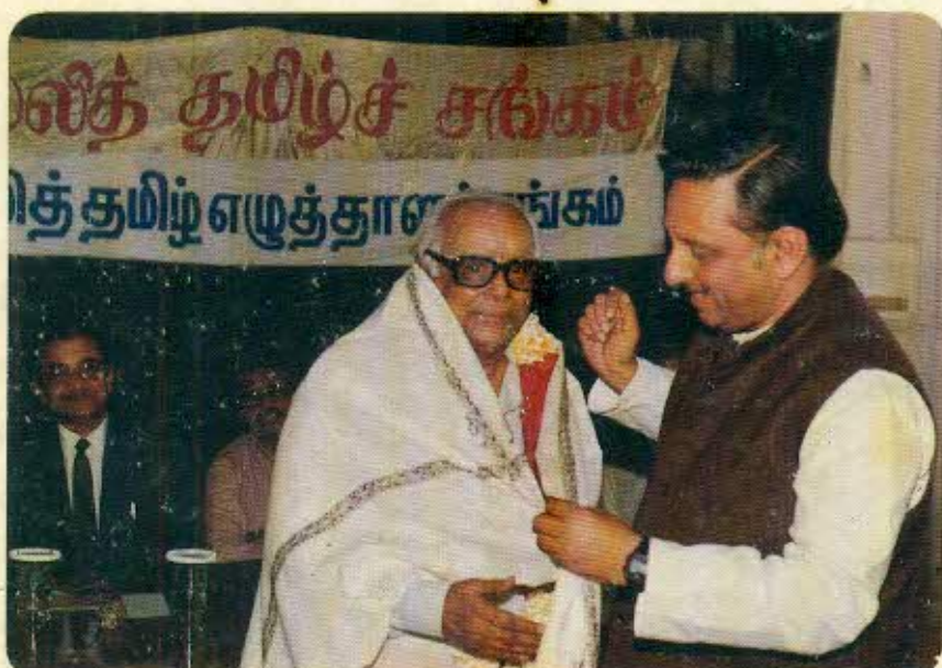
Felicitations function organised by Delhi Tamil Sangam.