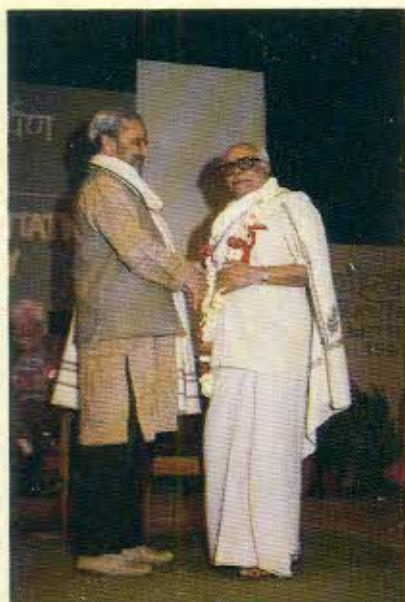
Receiving the Sahitya Akademi Award from Prof. U.R. Anantha Murthy.