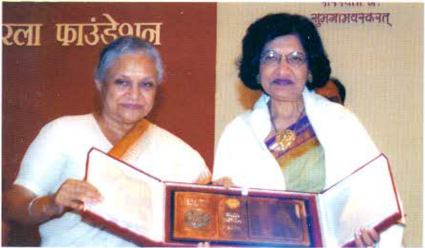
Receiving Vyas Sanman from Smt. Sheila Dikshit, C.M., Delhi, 2005