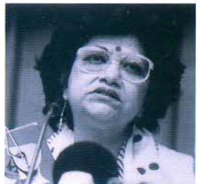
Reading in Berlin, Germany, 1993

Dostoevsky, Chekhov, Henry James, Jainendra and Rabindranath Tagore and popular works of Somerset Maugham, Oscar Wilde, Graham Greene, P.G.Wodehouse, Jane Austen etc instead of text books at an early age. It made her lose the fear of eminence; she could look the most famous man in the eye and discuss his work candidly. Her mother was a chronic invalid, neither a career woman nor a