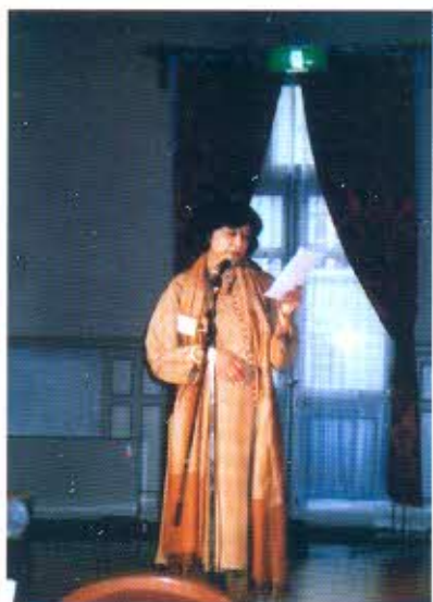
Reading in Yamagata, Japan, 2003

caring householder or mother but an avid reader of literature. Garg cherished her for being different, which later helped her create non-stereotypical women characters. If challenge is the force behind creativity, she was well-provided. Each bout of criticism by patriarchic critics gave her fresh reasons to write in her inimitable style. One of her earliest stories Avkaash ( A Few Hours , 1972) in which a woman having an extra-marital affair says, all she wants is a vacation, was the first to earn their ire. A mother of two and an affair, impossible in India, they said. As if children were amulets against lust! A critic reviewing Daffodils on Fire in English said, "Aversion, an understated story about a woman