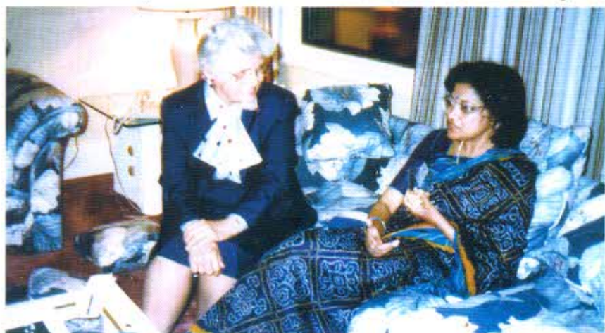
Keynote address at UN Colloquium of Women at IOWA, 1990

She came to be known as much for the audacity of her themes as the lyricism of her style. She had broken new ground with form and content in her early stories like Kitni Qaiden , Hari Bindi ( A Date with Me ), Daffodils Jal Rahe Hain ( Daffodils on Fire ) and novels Uske Hisse ki Dhoop ( A Touch of Sun ) and Chittacobra ( Chittacobra ) in the seventies. The diversity of her themes varied from suspension of female guilt in A Touch of Sun and Chittacobra ; the throttling hold of the joint family in Vanshaj ; the passionate interplay between personal and political turmoil in Anitya ( Halfway to Nowhere ); the conflict between creative genius and human emotions in Main Aur Main ; the male/female confrontation and its final resolution in the concept of ardhnaris'vara in Kathgulab ( Country of Goodbyes ) to the auto-fiction set in the age of