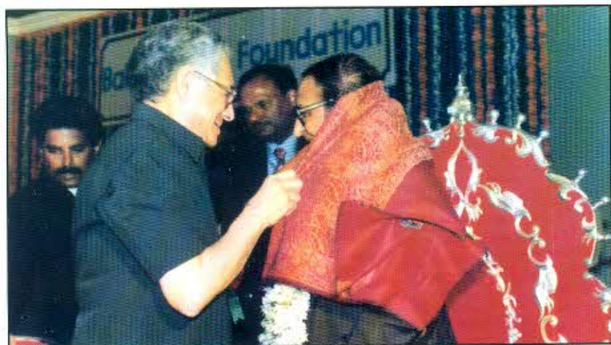
Receiving Babul Reddy Foundation Award from Soli Sorabji

'Kal mere lafzoan mein meri jaan rahbegi, Duniya jab dekhegi to hairaan rahbegi'.