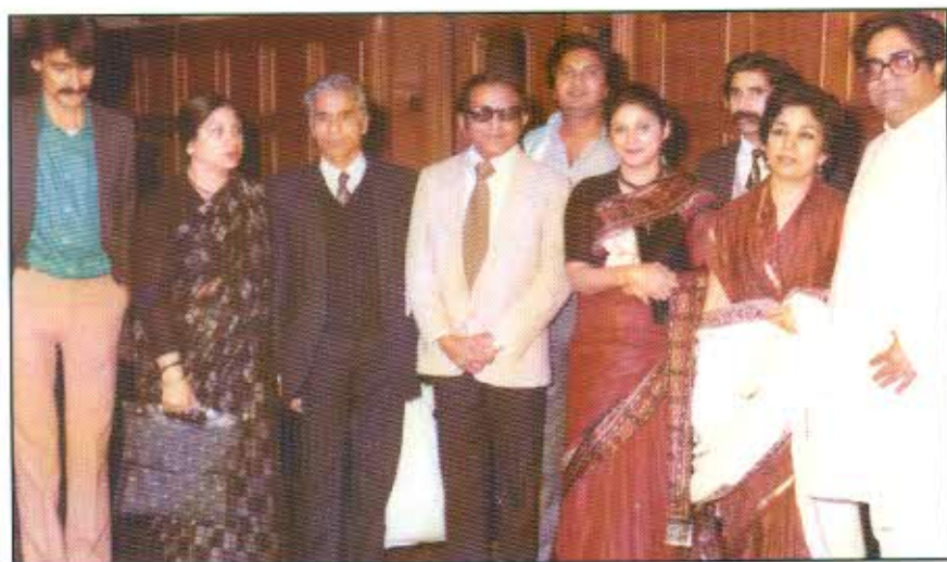
With fellow writers - Urdu Markaz, London