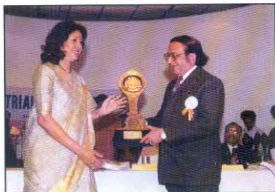
50 Years Independence Industrial Award by ICAP