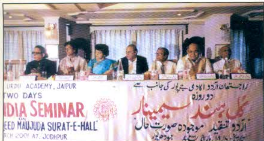
At Rajasthan Urdu Academy along with Prof. G.C. Narang and fellow writers