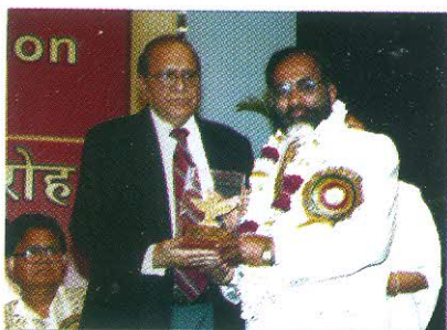
Receiving the Sahitya Akademi Award at the hands of Prof. Gopi Chand Narang

himself is the real father of the boy and this boy is helplessly striven to know his real father. The boy fights until he discovers his biological father, the mahajan. The much discussed novel now has also been translated in Marathi and has been published by Anuband Prakashan, Pune.