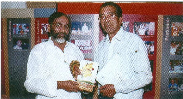
with Narayan Surve, distinguished Marathi poet

research orientation ultimately lead him to take himself to write a novel like Oh Babush depicting the local issues such as social tendency for achieving progress at the cost of local environment and destruction of land for mining and industries, in the state of Goa. The name of the protagonist of the novel "Babush" is a local popular name for a young boy who fights against the odd, challenging the dons and goons, in local power politics. Oh, Babush , is, as Shivdas rightly puts it, a novel for only young minds of Goa. Mhazan his another novel, is based on the local happenings during the Portuguese regime. The plot of the novel revolves around a young village boy, whose mother is a devdasi or a servant of God, also called 'bhavin' who bore an illegitimate son out of extra marital relationship and the boy finds it impossible to write his actual father's name. In reality, the head of the temple committee - the great mahajan -