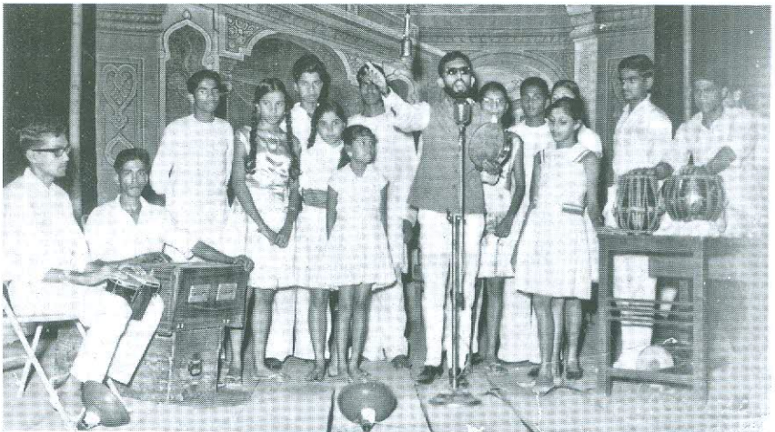
participated in a play at his school