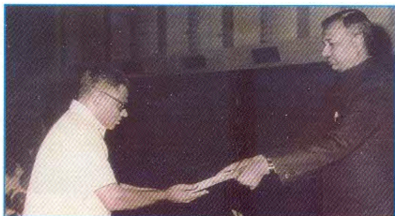
Receiving 'Anya Bhasha Shikshan' Award from D. P. Yadav, Union Dy. Minister for Education