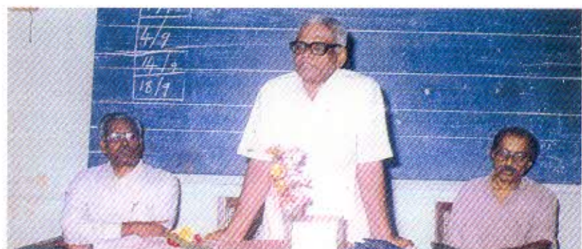
Addressing a meeting