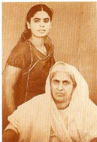
With her Mother.

I took my mother's hand in mine. Don't cry my dear mother. Please leave me alone. I just don't want to be insulted in the name of 'maryada' (respectability) and 'parampara' (tradition). Don't degrade our religion by oppressing a woman who wants to uphold her dignity. *