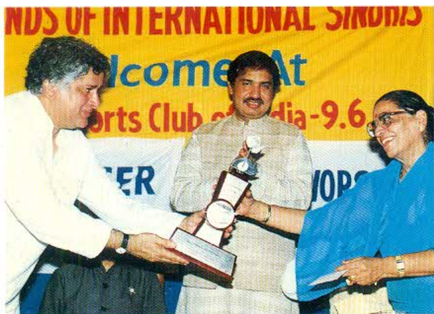
Getting Ishwari Bai Foundation Award from actor Shashi Kapoor.