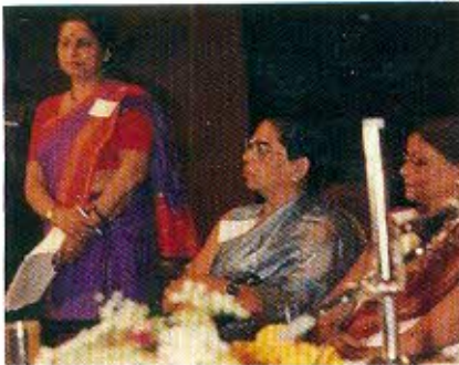
Felicitated by Akhil Bharat Lekhika Sangh, Nainital