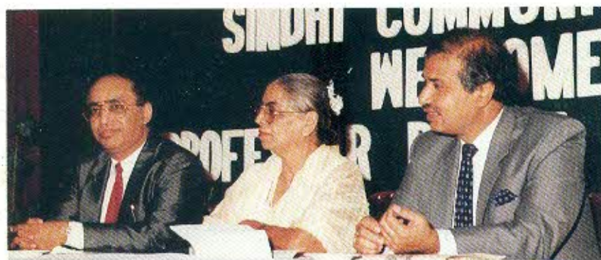
Felicitated by 'Assen Sindhi' Association of DUBAI.

PAUN PHUTI POPATI (Popati the dawn) Ulhasnagar: Veena Publications, 1988 167p. 21.5 cm.