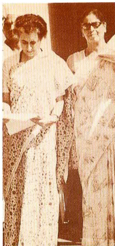
With Indira Gandhi.