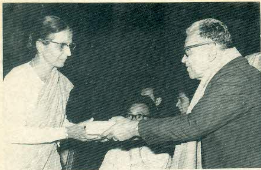
Receiving Sahitya Akademi Award from Prof. Suniti Kumar Chatterjee.

"To me literature should deeply assess the contemporary issues, trends and their situations in the society: analyse and interpret them to the present day context and suggest creative and practical solutions" - says Smt. Rajam Krishnan in an introduction in one of her novels.