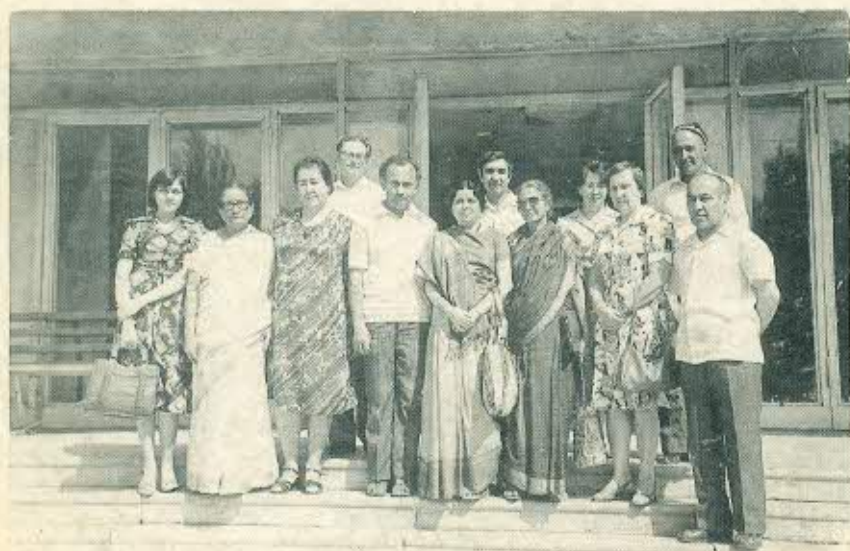
During a visit to Russia.