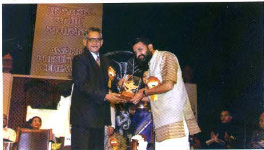
Receiving the Sahitya Akademi Award 2009 at the hands of Sri Ramakant Rath