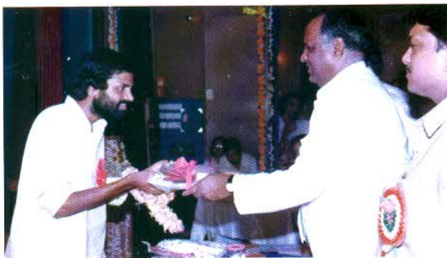
Receiving State Government Award at the hands of Sri Sharad Pawar

The major concern of his writings is the changing contemporary rural culture. His novels Dhingana , Kalap and Tanakat deal with the changing rural life and culture. They have successfully encapsulated the inner turmoil of the educated, frustrated youth of the day. His