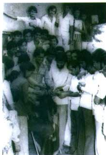
at Jatamukti Devadasi movement

His literature mirrors socio-cultural scenario of the last four decades with changing rural culture, inevitable attack of globalization, protest in villages, and depiction of the world of the women. His multifaceted literary writing has become a milestone in Modern Marathi literature.