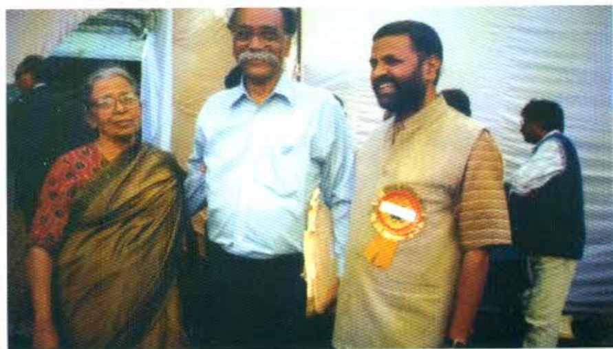
With Sri Bhalachandra Nemade & Ms Mahashoeta Devi

His novels Tanakat and Bandarbhog and some short stories are translated in Kannada, Urdu, Tamil, Punjabi, Hindi and Assamese. He has worked for various prestigious literary institutions and organizations and academic bodies. He has also worked as Member, Marathi Advisory Board, Sahitya Akademi, Maharashtra Foundation, Language Advisory Committee, Government of Maharashtra, Maharashtra State and Language Development Society. He was President of second Annabhau Sathe Sahitya Sammelan held in