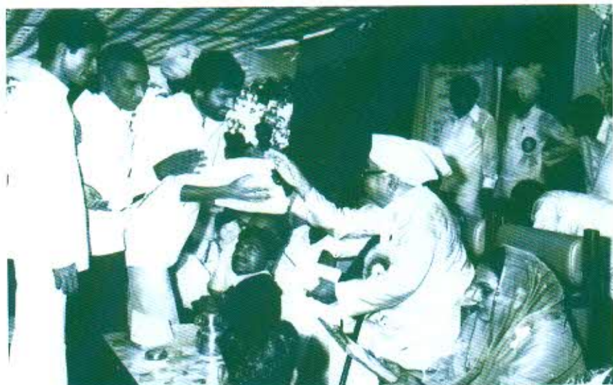
Being felicitated at the hands of Yashwantrao Chavan & Vasantdada Patil

novels express his exceptional sensibility to the rural culture of Maharashtra. These novels come up with his brilliant insights into changing social values, power relations and conflicts. His novel Tanakat has won the Sahitya Akademi Award in 2001.