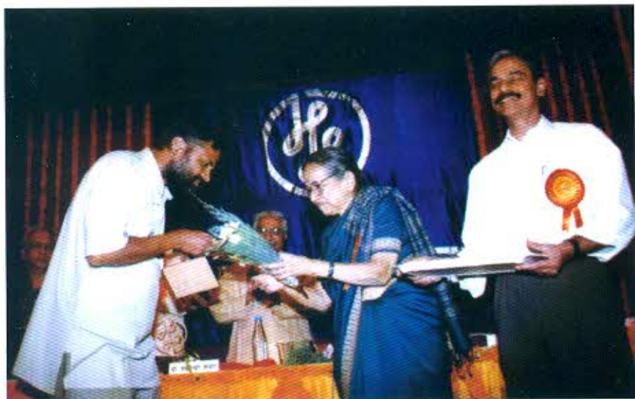
Receiving Maharashtra foundation Award

included in three collections entitled Kachakavadya , Kaifiyat and Local to Global , were serially published in the reputed Marathi newspapers and periodicals. This writing is a spontaneous response to the various social events happening in the surrounding area and reflects his global value-based approach. He has also written two critical books on the contribution of Bhau Padhye, distinguished Marathi Marathi fiction writer, to Marathi Literature. He has edited books on two important Marathi writers of post-60s - Bhalchandra Nemade and Ranganath Pathare.