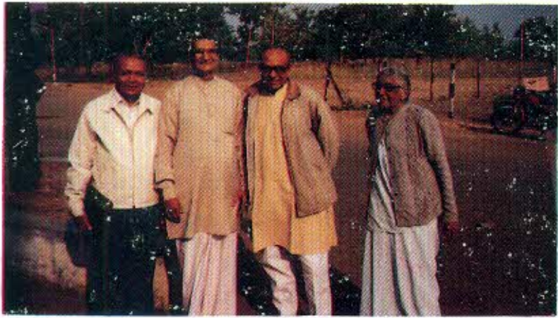
With his friends

AMBE AUYA MOR Ahmedabad : Gujarati Sahitya Parishad 1985, 32.5Cm.