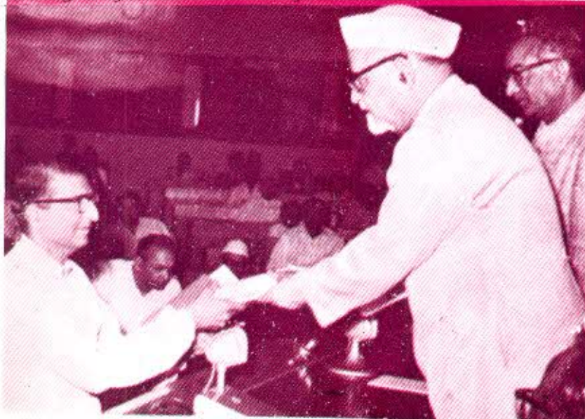
Receiving Sahitya Akademi award 1964 from Dr. Zakir Hussain