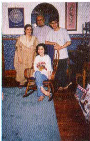
With his wife, daughter and son

His literary achievements have brought him many honours. He received the Kavi Nanalal Parotoshik from Gujarati Sahitya Parishad, Gujarati State Award for poetry, the Jayant Pathak Award for the best collection of poems and the Ramaprasad Bakshi Award for his book Ramani Yatano Vagvikalpa (1979). Simanhan ane Simollanhan (1977) won for him the Gujarat State