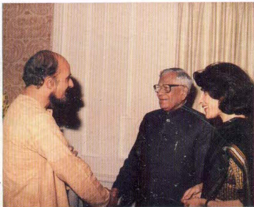
With the former President of India R. Venkataraman

From Odyseusmu Halesu to recent poems like "Simhavahini Stotra", "Ranakhya/Jalastotra" and "Pyalo" (re-employing many pre-modern genres of Indian poetry), Sitanshu Yashaschandra's poetry marks some of the highest points of modernity.