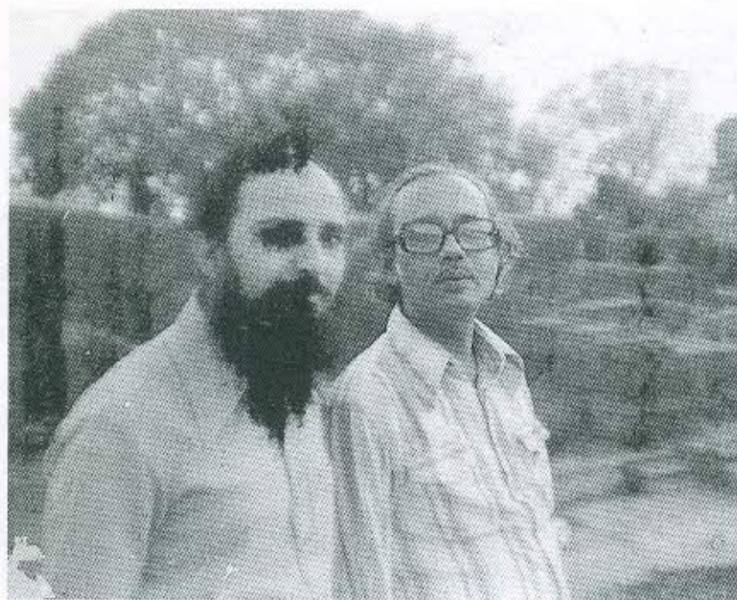
With Shakti Chattopadhyay at Nalanda 1976