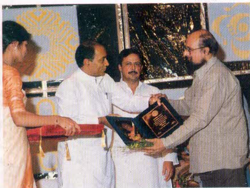
Receiving Kabir Samman 1998 from Digvijay Singh, Chief Minister of Mahhya Pradesh, Bhopal