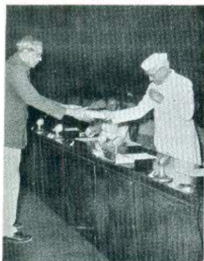
GOKAK RECEIVING THE SAHITYA AKADEMI AWARD FROM JAWAHARLAL NEHRU, 1961

Twenty-seven years ago Vinayak Krishna Gokak had received the Sahitya Akademi Award for his DYAVA PRITHVI , "Nirada" and "Ilgita", the two long poems in the volume, present symbolic pictures, of the cloud as viewed from the earth, and of the earth as seen from the sky, a unique conception of man's evolution and his future. The grandeur of the poet's vision and its lyrical expression have been cited as outstanding contribution to Kannada poetry.