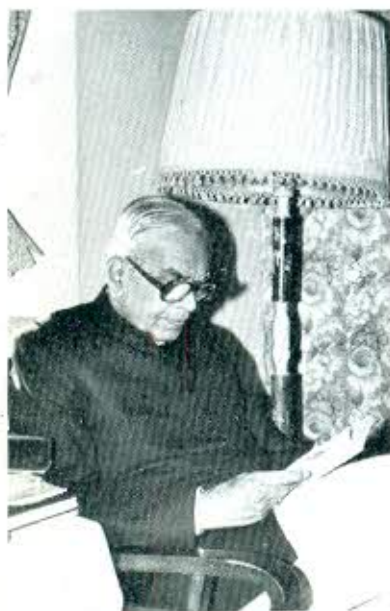
GOKAK IN HIS STUDY