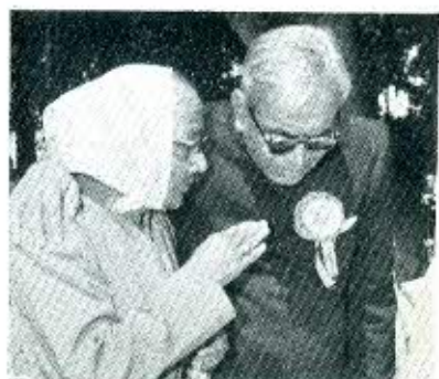
GOKAK WITH BENDRE ON BENDRE'S SEVENTIETH BIRTHDAY

a rare combination of the visionary and the realist. Nature on the fringe of the Malenad has thrilled him. The mystical tradition in Kannada and English poetry has nourished his genius. Journey abroad towards the east and the west, residence in different parts of India and wide contact with varied people — all this has widened his horizon and enriched his experience. The philosophy of Sri Aurobindo has provided the base for his thought. The study of socialist ideology has heightened his social awareness. He has opened new paths in Kannada poetry and made unique experiments in form and content. In more than 15 of his collections we come across lyrics, longer poems and verse plays, set to a high key. His lyrics mirror the moods and thoughts of an aspiring and assimilating personality. In them, the high ideals of surrender to the Divine have sought powerful expression in intense language. The dreaminess of Shelleyan temperament is part of the poet's make-up. But it is noteworthy that he does not swing to any extreme and that he brings together all the different notes into his own symphony, as a result of his Indian background and his own Sadhana.