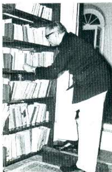
GOKAK AS VICE CHANCELLOR BANGALORE UNIVERSITY