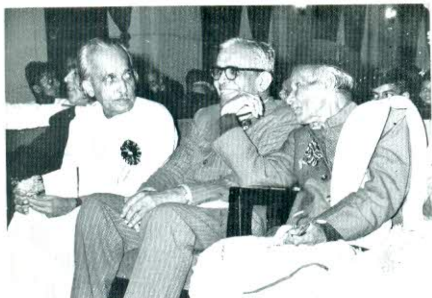
KARANTH, GOKAK AND MASTI