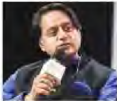
Congress leader Shashi Tharoor