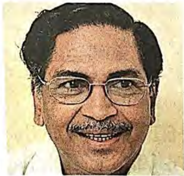
വി. മധുസൂദനൻ നായർ

മണ്ണും വെള്ളവും ആകാശവും അന്യമായ നഗരത്തിൽ കഴിയുന്ന അച്ഛനും മകളുമാണ് 'അച്ഛൻ പിറന്ന വീട്' എന്ന കവിതയിലെ പ്രമേയം. ബ്രിട്ടീഷ് കോളനിവാഴ്ചയ്ക്കിടയിലെ ഇന്ത്യൻ അനുഭവങ്ങളുടെ സു