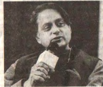
Congress leader Shashi Tharoor