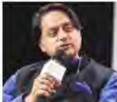
Congress leader Shashi Tharoor